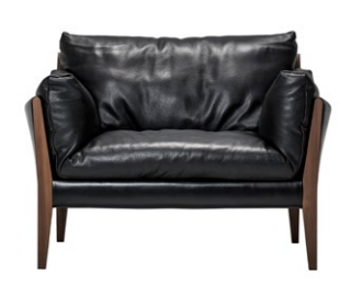
1 SEATER SOFA

The leather wrappings on the frame adjust the feel of the wood, bringing its wild nature under control and camouflaging its form to make the walnut stand out even more. The hues of the leather are as close to natural as possible, balancing well with the walnut as no inorganic, uniform color could. The fusion of walnut and leather creates a high-grade feel, and expresses the ambiance of Japan through wood, leather and cloth.