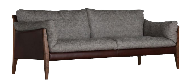
3 SEATER SOFA

Seat, back, arm cushions upholstery: Removable leather and fabric