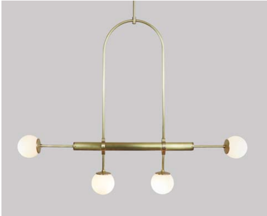
Pendant light object

Inspired by the simplicity of Light Object 018, this new object is LED based light and it utilizes the design power of round light with the support of simple lines and comforting shapes.