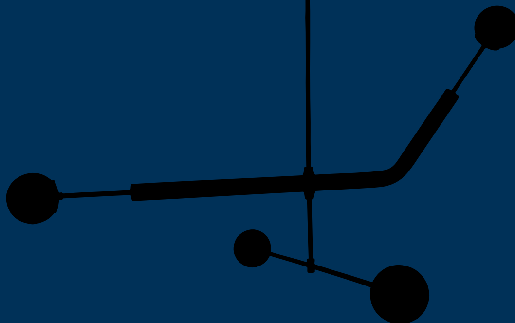
NAAMA HOFMAN LIGHT OBJECTS THE 020 COLLECTION